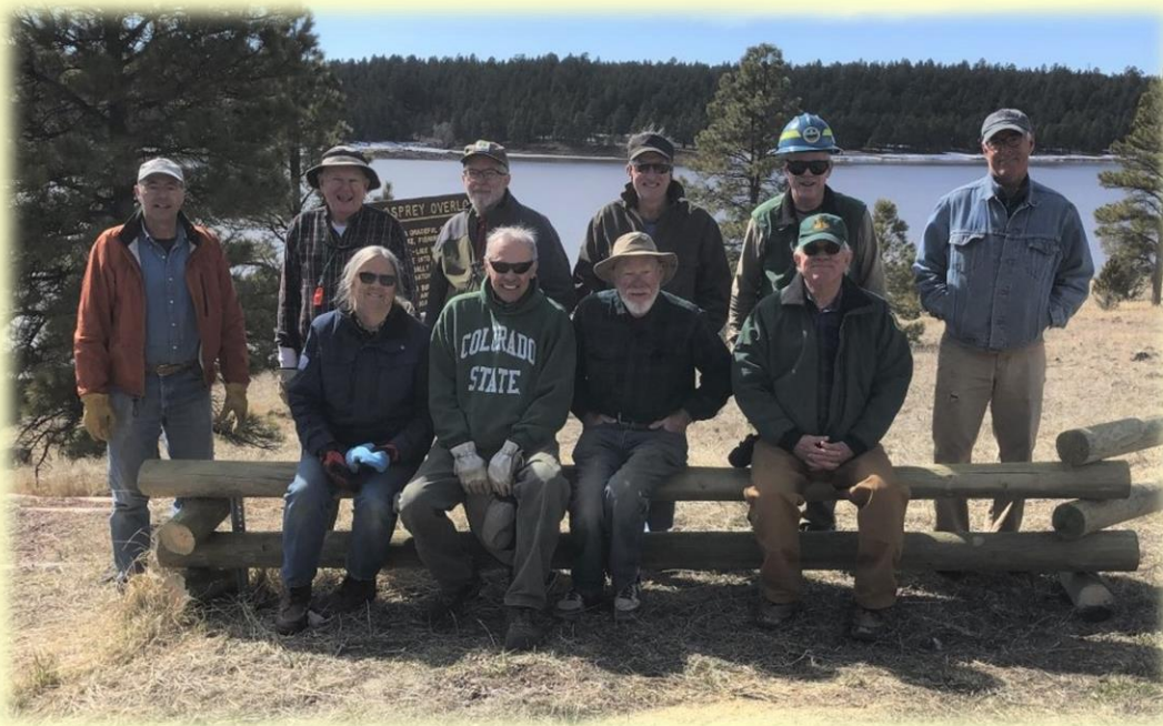
Early spring Aspen Team members

The FoNAF website is updated monthly to reflect the most immediate project lists and can be found in the “Events” section of the website.